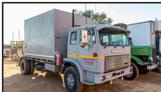
Shell Grey Ghost