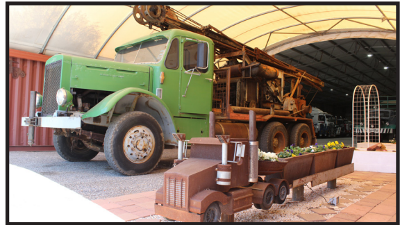
Green Drill Truck - Leyland