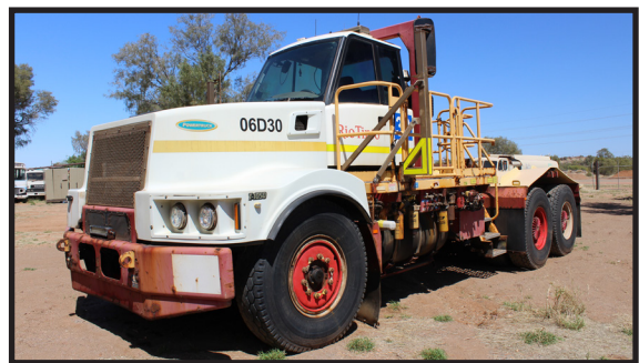
RIO Tinto Truck