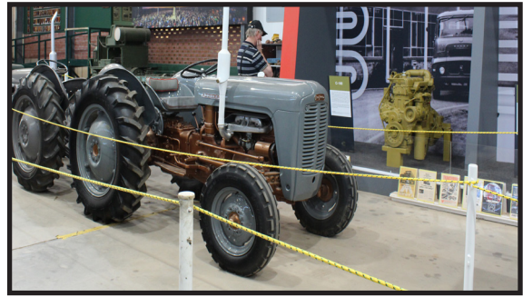
Ferguson Grey Gold 35