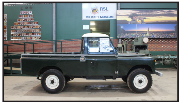
RSL Land Rover