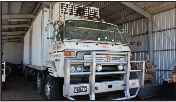
The Egg Truck - UD