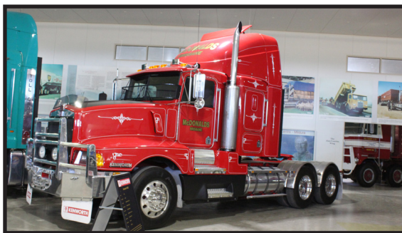
McDonald's T60 Kenworth