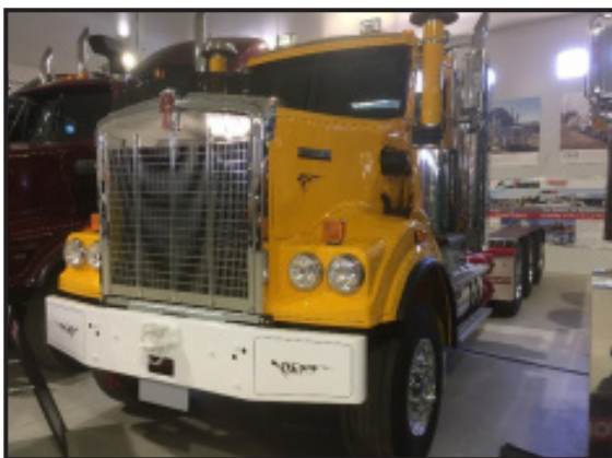
Kenworth C509 Tri-drive

Front axle is Meritor FL941 with a rating of 9100KG. including Kenworth Slipper spring suspension.