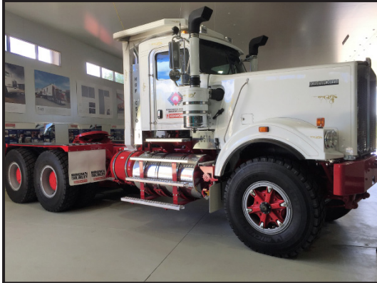
C510 at Kenworth Hall of Fame

At the Kenworth Hall of Fame there are two brand new C5 series heavy duty trucks proudly on display. First is a C510 6x4 featuring a GCM of 160,000kg, the other is a C509 8x6 tri-drive with a GCM of 171,000KG. Both feature day cabs with Roll over Protection System (ROPS) on the C510.