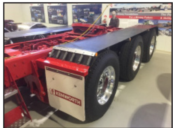
Meritor R278-1866 Tri Drive Axles

The C509 tri drive specification is Cummins ISX E5 550HP coupled to an RTLO22918B 18 speed manual transmission. Rear axle is Meritor R278-1866 tri drive axle assembly on New Way AD369-10 rear spring suspension.