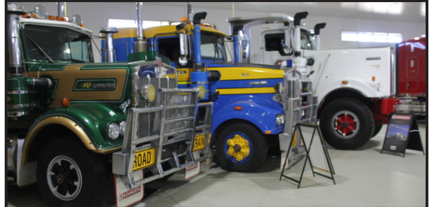
C510 size in relation to the T650 adjacent

The C510 was designed to meet the specific needs of very high GCM mine haul operations, It incorporates a very robust 19 litre engine with cooling capacity comfortably exceeding the 50 degree ambient temperatures commonly experienced in the remote mining areas of Australia.