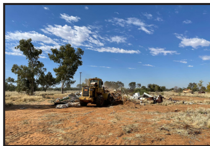
Clearing for outdoor museum