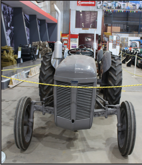
Ferguson TEA20 and Ferguson TE35