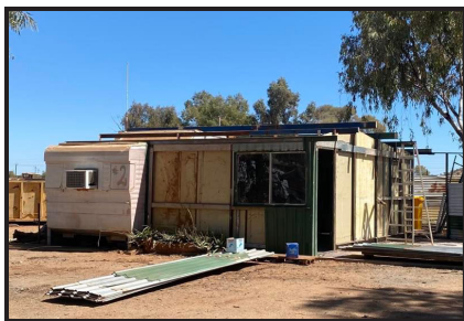
Removing non-compliant buildings