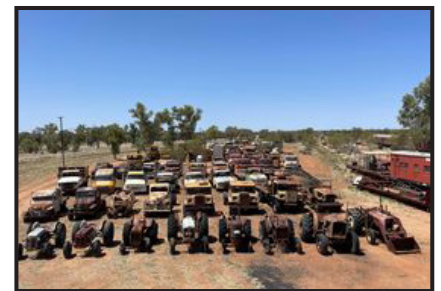
Arranging the outdoor museum